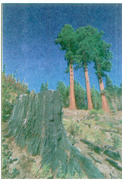
From sequoia forest to scarred landscape, left — the aftermath of federal timber management in the Sequoia National Forest. Below, smoke from woodstoves in the Truckee area fills the once-clean sky above Donner Lake with a brown, foul-smelling and unhealthy haze.